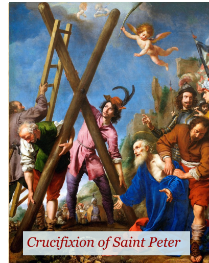
Crucifixion of Saint Peter

“Everyone who acknowledges me before others, I will acknowledge before my heavenly Father.” Matheus 10:32